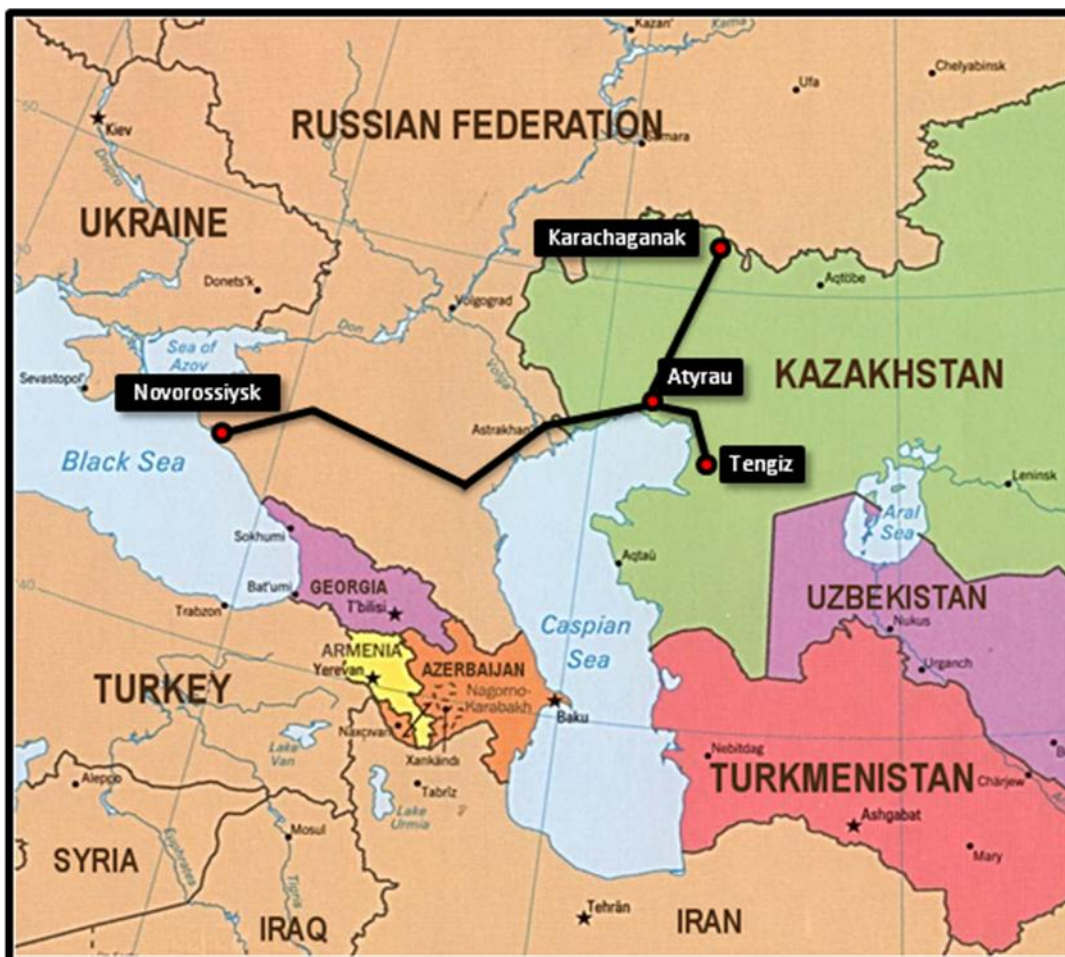
CPC Pipeline and the KPO Export Pipeline.

The Caspian Pipeline Consortium (CPC) is the largest international oil transportation project involving Russia and Kazakhstan, as well as the world's leading extraction companies. The CPC pipeline carries oil mainly from the Tengiz and Karachaganak fields, which is then transported to a marine terminal in the village of Yuzhnaya Ozereyevka (Novorossiysk, Russia), and then loaded onto tankers for shipment to world markets. Each year, the CPC carries more than a third of the total oil exports of Kazakhstan. 172