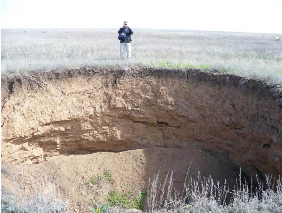
Karachaganak Oil and Gas Condensate Field. Sinkhole near the village of Zhanatalap.

presence of more than 25 toxic substances in the air. 157 In 2005, the Regional Department of Ecology temporarily withdrew the KPO's license to operate due to environmental violations, including the emission of 56,000 tons of pollutants into the atmosphere in 2004 alone. 158 During the public environmental review conducted by the Kazakh Society for the Conservation of Nature, it was found that the actual emissions of harmful substances into the atmosphere by KPO exceeded permissible limits by 3.3 times in 2004, and by 2.8 times in 2005. 159 The consortium has been repeatedly fined tens of millions of dollars for emissions exceeding permissible limits. 160 In 2012, heavy fines were imposed on KPO for unauthorized pollution of the surrounding environment. In April of that year, KPO paid US $51 million for gas flaring in 2010. 161 In July of 2012, the court further fined the company US $31 million for emissions in 2010-2011. 162 However, no matter how great the fines, they are always compensated from the Kazakh share in the project, according to the agreement for Karachaganak. Therefore, foreign investors do not lose anything. In the end, their negative activities in Karachaganak are paid for by Kazakhstani taxpayers. 163