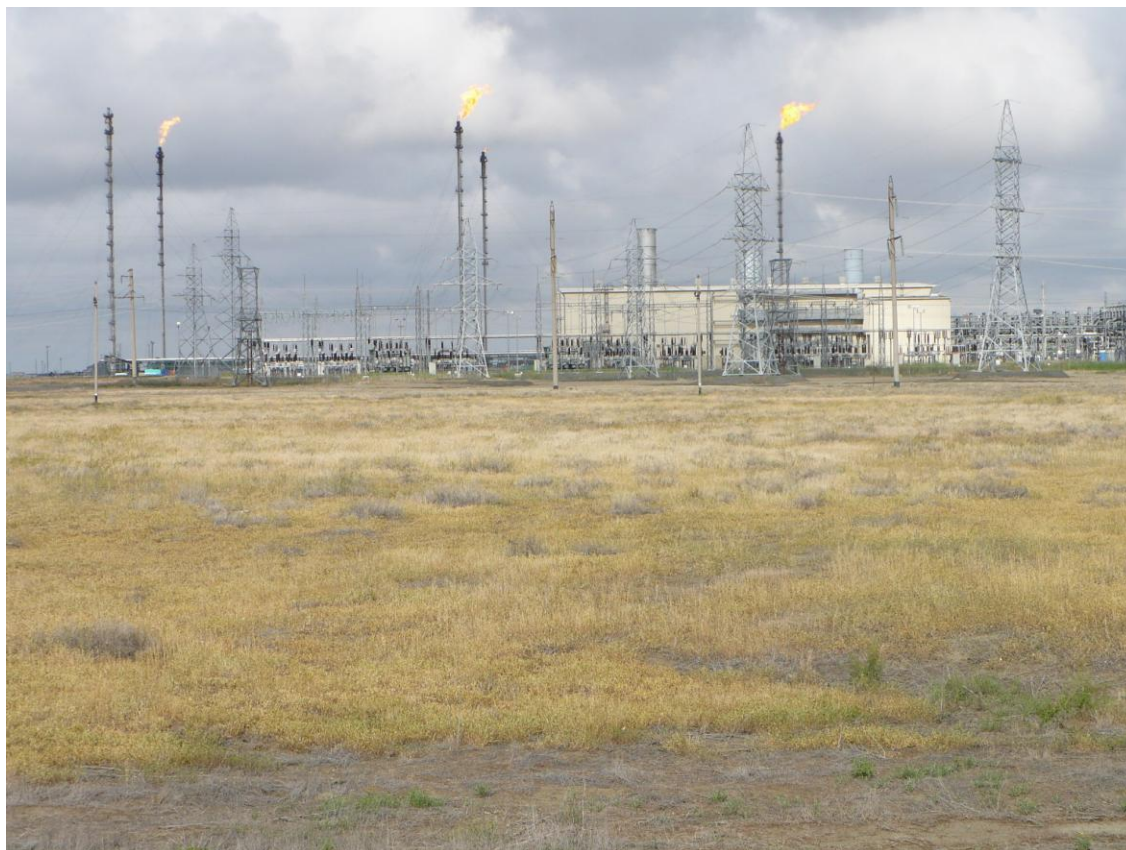
Tengiz Field.

A major problem is that the government authorities and the public do not have objective data on the impact of TCO on the environment and people of the region. On one hand, there is no complete picture of the contamination, as currently the environmental monitoring on Tengiz is limited to only 5 elements, including hydrogen sulfide (H 2 S), sulfur dioxide (SO 2 ), nitrogen dioxide (NO 2 ), nitric oxide (NO), carbon monoxide (CO), and hydrocarbons (methane). 49 However, over 70 harmful substances are emitted in the field. 50 On the other hand, there are concerns about the reliability of data provided by TCO, and there is no alternative source of information. Currently, environmental monitoring is implemented at 14 TCO stations, which are located along the perimeter of the Tengiz and Korolev fields as well as in the TCO monitoring settlement and the settlement of Karaton. Industrial monitoring is conducted by a private enterprise, «Gidromet Ltd». 51 There is no governmental monitoring of air quality at Tengiz due