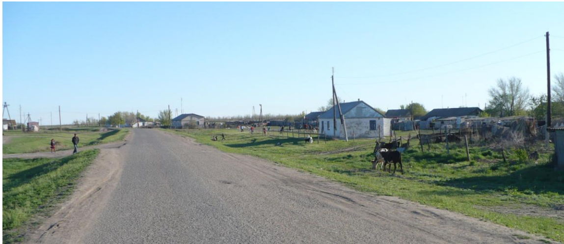
Village of Berezovka.

Chevron holds an 18% share of Karachaganak Petroleum Operating, BV, the consortium that also includes the BG Group (29.25%), Eni (29.25%), LUKOIL (13.5%) and KazMunaiGas (10%). 155 Chevron is not the operator at Karachaganak and tries to distance itself from the existing problems there. However, they are very similar to the problems at Tengiz.