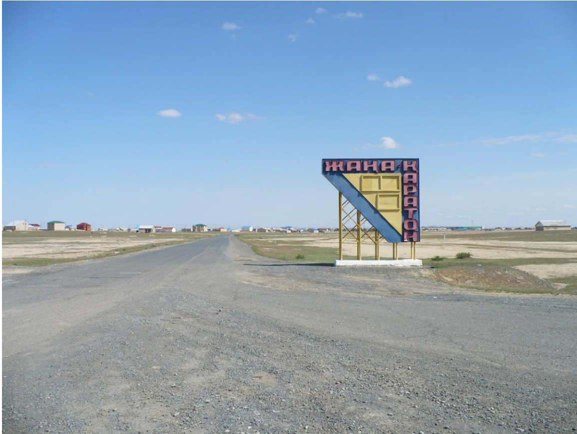
Village of Zhana Karaton.

Only 10 years after its arrival at Tengiz, Chevron began to address the problems of local populations caught in the zone of impact of the field. In particular, with regards to the village of Sarykamys (3450 people), which was located on the border of the TCO 10 km sanitary protection zone. From the beginning of the development of the field, the villagers began to experience the impacts of the Tengiz complex. Despite repeated assurances by TCO that the impact on the environment was negligible, the health of the residents reportedly started to sharply deteriorate. By the beginning of the 2000s, according to doctors, 90% of the village was sick. The average life expectancy was 46 years. 143 By this time, 189 people had died in Sarykamys, aged 24 to 53 years, since the beginning of the field development. 144 Only when the situation in the village started to resemble a local environmental catastrophe, did the government of the Republic of Kazakhstan pass Resolution no.321, dated 18 March 2002, on the resettlement of the population away from the sanitary protection zone of the field. 145 It should be noted, however, that the issue of resettlement of Sarykamys had been raised even during the Soviet Union, immediately after the discovery of Tengiz. It should also be