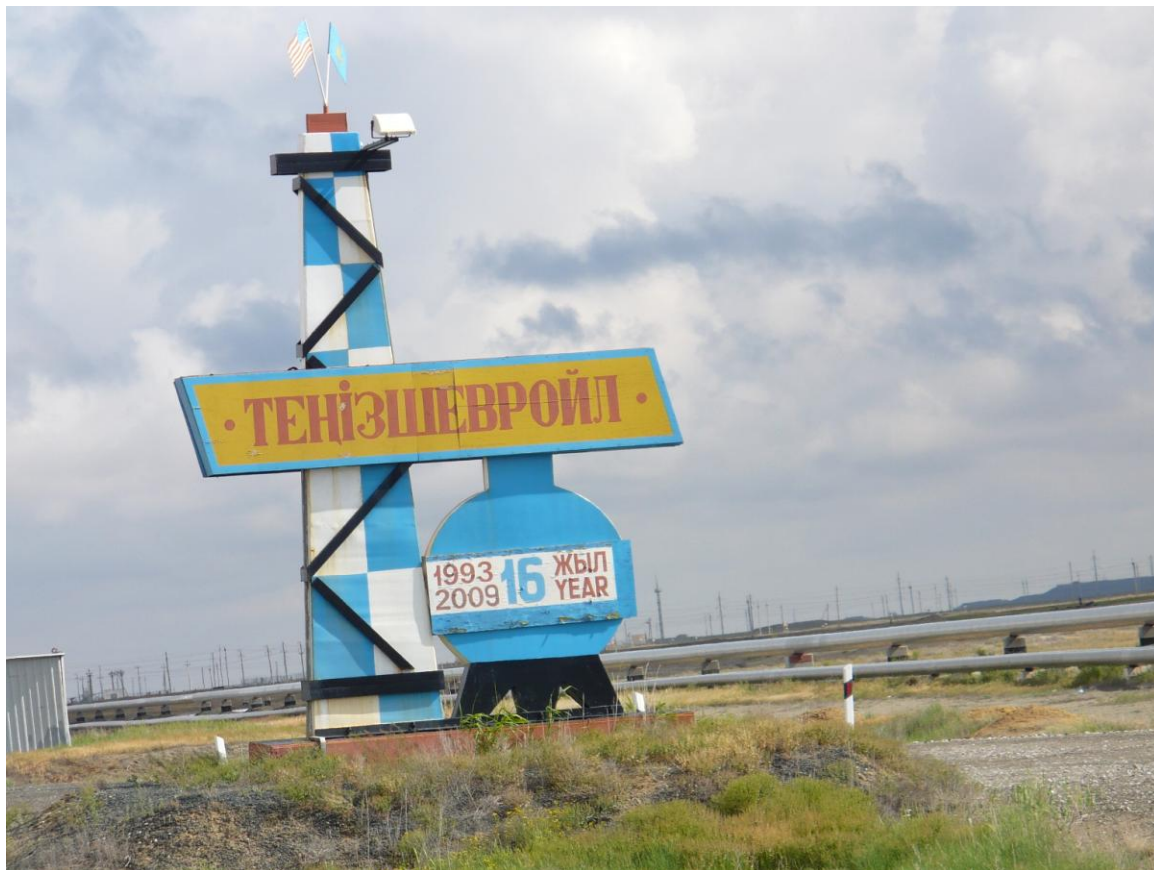
The Tengiz Field.

The deal with Chevron at Tengiz strengthened Nazarbaev’s political position in the country. In the autumn of 1991, he publicly announced that the Republic was expecting an investment boom in the coming years, the welfare of its people was expected to grow in connection with the arrival of American capital and technology, and that the empty Soviet shops would soon turn into Western supermarkets. These promises played a key role, and the vast majority of the population voted for Nazarbaev in the first general national Presidential election in December 1991. However, the anticipated imports of US technology did not materialize, and the country was doomed to export raw materials. 19 Nevertheless, the political and economic support of both Chevron and the United States played their part in the development of the young sovereign state.